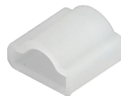
XA033 DYCE End CAP L 11 x W 12 x H 7