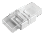
XA031 DYCE Strip to Strip Connector L 35.5 x W 15.3 x H 8.5