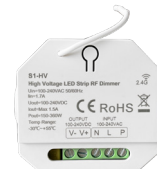
XA039 DYCE Dimmer Module Max 25m L 56 x W 49.50 x H 28