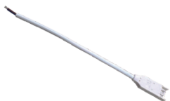
XA030A DYCE Quick Connector with wire (for 230V only)