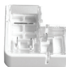
XA032 DYCE L Connector L 24 x W 24 x H 8.5