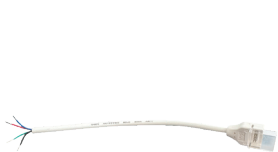
XA035 DYCE RGB Quick Connector with wire 10mm L 216.5 x W 15.3 x H 10.5