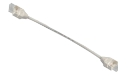
XA038 DYCE RGB Strip wire Strip Connector 10mm L 216.5 x W 10 x H 10.5