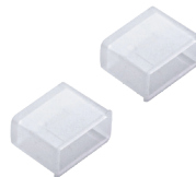
XA017 End cap for DYCE RGB L 1.5 x W 1.4 x H 0.7